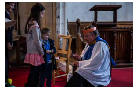
Events involving our children from around the benefice