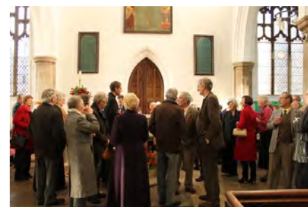
Photos representing a selection of events across the benefice