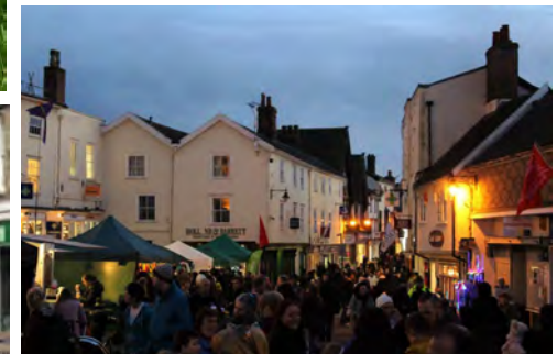
bottom left: The Mere, clockwise from top left: The Boardwalk, The Heritage Triangle, the Mere, The Corn Hall, Mere Street, Diss town sign, Quaker Wood, Diss Market